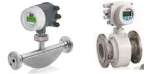
ABB PROCESS ANALYTICS

Providing real-time analysis of a process sample or stream.