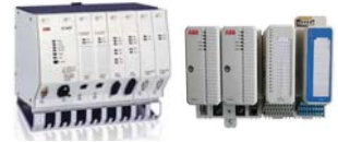
ABB PROCESS ANALYTICS

Providing real-time analysis of a process sample or stream.