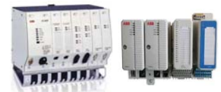
ABB PROCESS ANALYTICS

Providing real-time analysis of a process sample or stream.